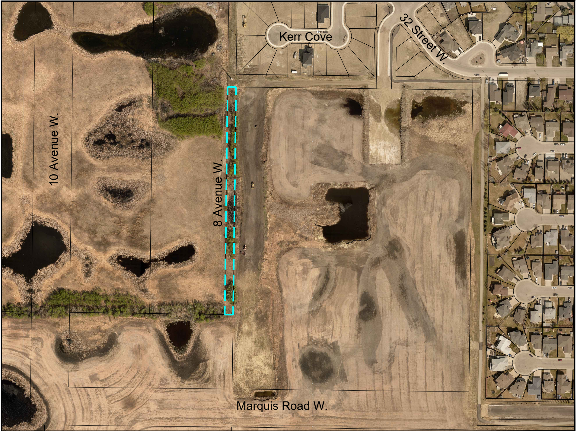
8th Avenue Right of Way - Location Map